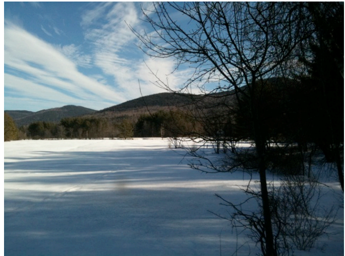
Looking southeast from the corner of the field near the bank of the Bearcamp River toward Route 25 and the Ossipee Mountains